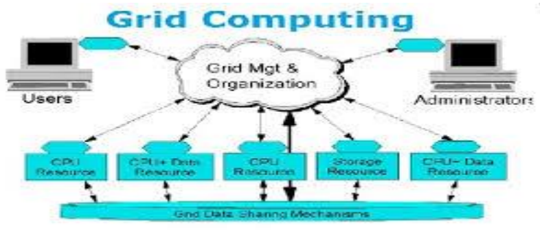
Figure 3: Grid Computing Functioning

The computing grid and the data grid are two main types of grid computing which is to deal with achieving higher computing power or higher storage capacity. On the other hand, the cloud computing types includes infrastructure as a service, platform as a service, and software as a service. These three types provide infrastructure storage, platform and its application, and specific software as a service respectively.